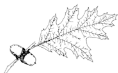
Northern Red Oak