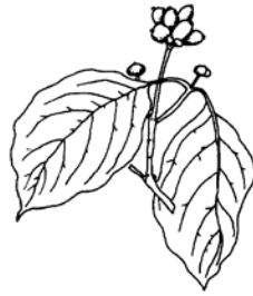
White Flowering Dogwood