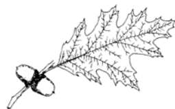
Northern Red Oak