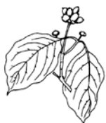
White Flowering Dogwood