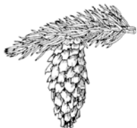
Colorado Blue Spruce